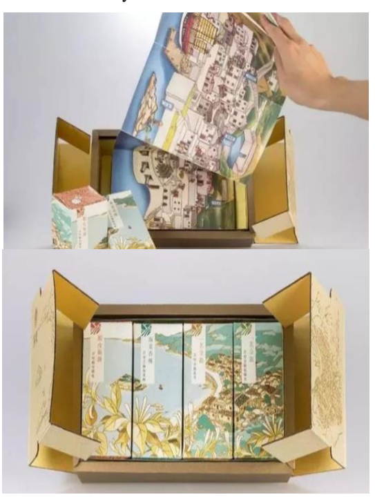
Figure 3 Cinbi Century Map in the agricultural product design of Cinbi Village.

regional characteristics are deeply imprinted in the hearts of the people, which can achieve excellent publicity effect. Packaging focus should be combined with regional culture. For example, the agricultural product design of Cinbi Village (such as "Figure 3") makes good use of the local characteristics, and uses the cultural and creative design of agricultural products to spread the rural culture, and also lays the foundation for its brand establishment. Honeysuckle is the most distinctive local agricultural product there. The villagers dry the honeysuckle and then seal it with plastic into bags after drying. After that, they combine the local culture to make a set of "Honeysuckle tea" packaging, and put a picture book "Cinbi Century Map" in the packaging to introduce the local scenic spots and history, which leaves an impression to people and makes people deeply understand the meaning of the culture, which will also add points to its taste visually.