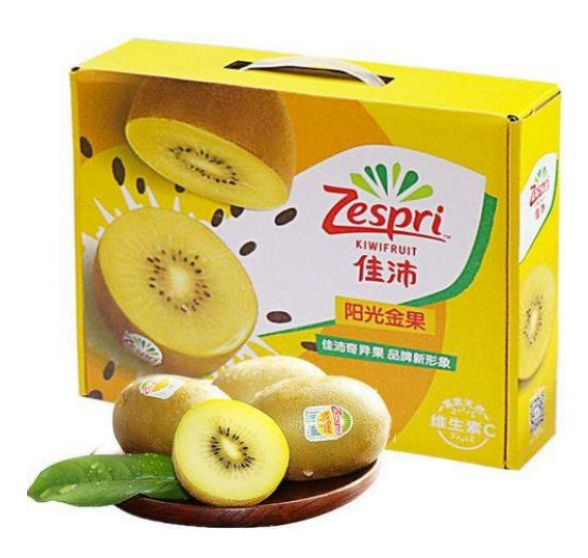
Figure 1 Zespri gold kiwifruit packaging.