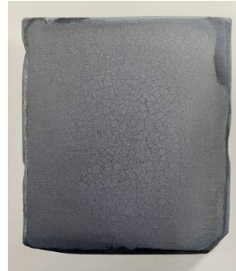
Figure 3 "Kiln 2", 2014, oil paint. Lacquer. Flax. emulsion, 54x 48x 5cm.

fulfillment, and desire, a very coherent sense of oppression.