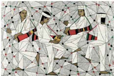
Figure 1 "The Sound of Elephant Feet Drums" created by Qiao Shiguang in 1983, with a size of 91x61cm. Image source: Yachang Art Network.

Another manifestation of crack texture formation in lacquer painting is manual molding, such as eggshell inlay, mother-of-pearl inlay, lacquer skin inlay, and other lacquer painting techniques, which all produce crack texture. If used properly in the personal creative process, it often produces a variety of effects. The eggshell not only serves as the white color in lacquer painting, but also the texture of the cracked eggshell itself makes the white color in the image richer and more vibrant. In addition, the front and back of the eggshell will exhibit different texture effects. And mother-of-pearl can also be processed into various shapes. If mother-of-pearl has good permeability, it can also present a variable background color in the cracks of free splicing. After repeated painting and polishing, the lacquer skin will present a flaky texture effect, similar to the texture of an eggshell naturally cracking under external force. The eggshell inlay in the background of Qiao Shiguang's lacquer painting "The Sound of Elephant Feet Drums" ("Figure 1") is cut and extended according to the dynamic dance patterns of the characters, using crack texture to express the spatial relationship between the person and the background, enriching the visual hierarchy.