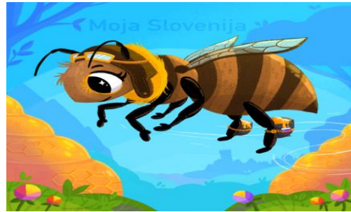
Figure 1 Virtual Proxy - Carniolan Bee.

huge museum, where people can walk into this beautiful country through virtual reality technology. Interestingly, the virtual museum has a cute virtual image of a bee (the Slovenian endemic species, Carniolan bee), which serves as the virtual proxy of the visitors and takes them to every corner of the Republic of Slovenia and even the world, thus allowing the visitors to emotionally engage ("Figure 1").