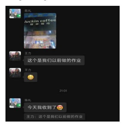
Figure 3 The student's attention to Luckin Coffee.

And combined with "Figure 3", students noticed Luckin Coffee's shop and poster when they went out, which shows that the teacher's guidance can effectively enhance international students' attention to the LL in public spaces.