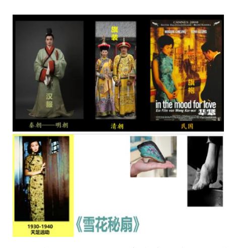
Figure 7 The courseware of chaing dress and customs.

Thirdly, New Information, student feedback reflects their desire for new information, especially in the era of information explosion, breaking the "Information monopoly" of teachers, the adult identity of the students in this case already has a stable value system, so the teacher's role is more to expand the social and cultural knowledge of modern China, guide students to think.