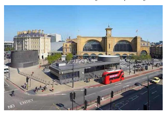
Figure 2 King's Cross station square in London.