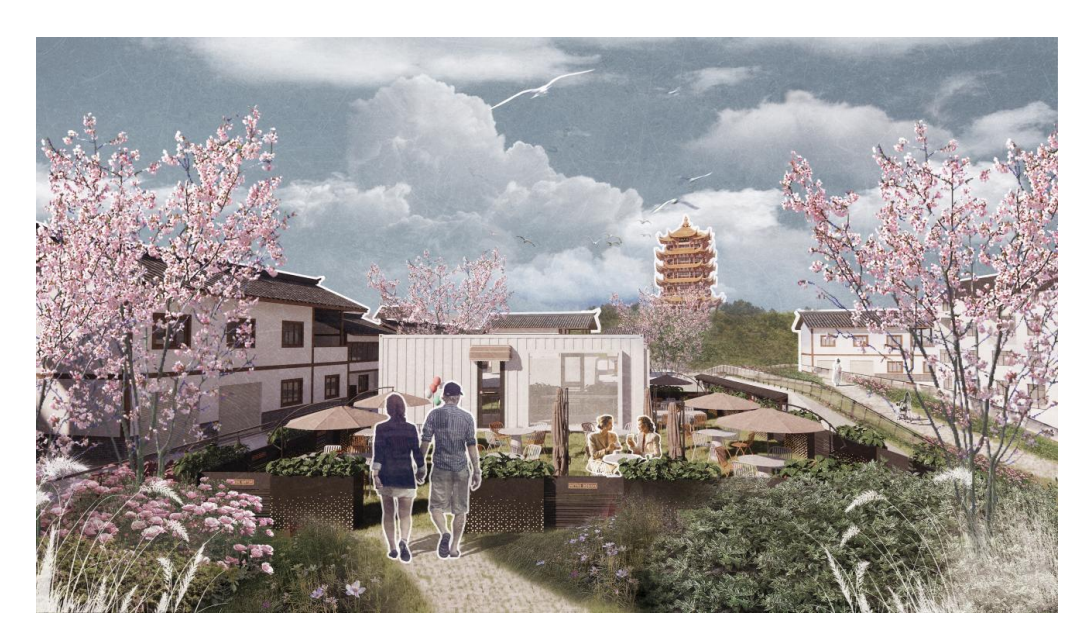
Figure 11 Rendering 2.