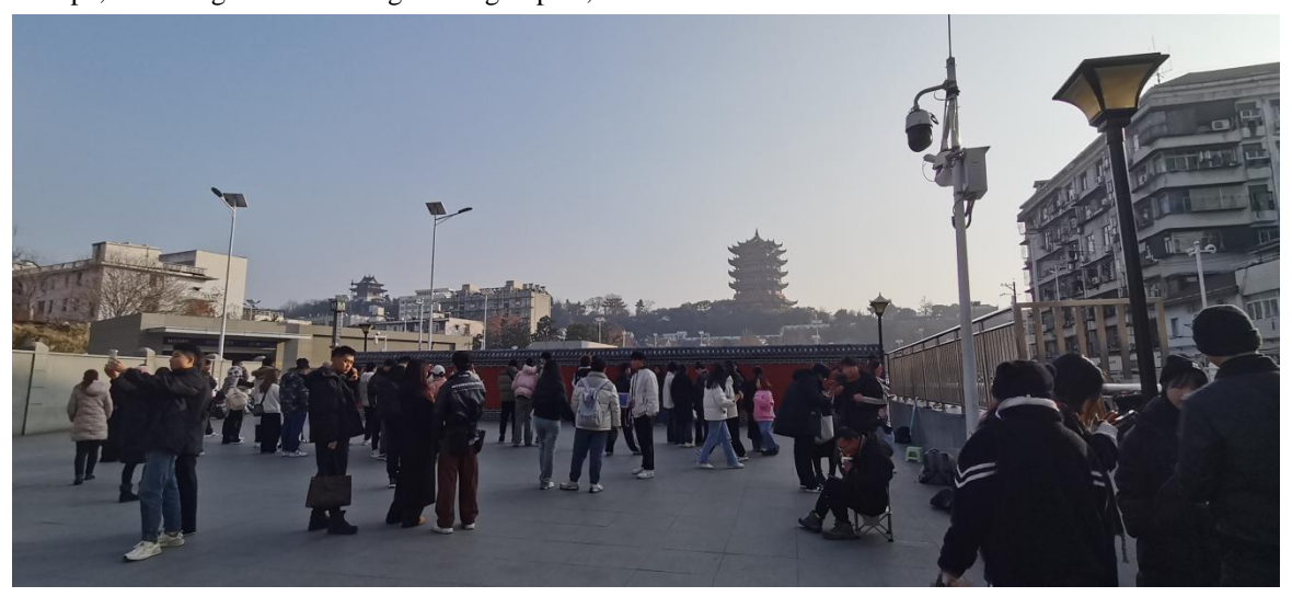
Figure 7 Internet hot wall next to subway entrance.

increasing leisure space and improving infrastructure.