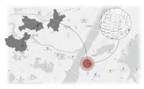
Figure 5 Location analysis.

heritage. Public spaces around the Yellow Crane Tower have problems such as inconvenient parking, traffic congestion, and environmental chaos, and need to be renovated. Although the neighborhood is a popular check-in point, but the lack of rest and accommodation facilities, the narrow flow of people, shabby, affecting the impression of foreign tourists. Therefore, the renovation of the public space around the Yellow Crane Tower can enhance the visitor's viewing experience, provide residents with a comfortable landscape environment, and improve the image and quality of life of the city.