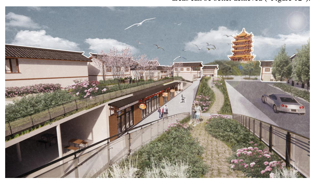
Figure 10 Rendering 1.

In the design scheme, the first consideration is to preserve and enhance the value of the surrounding historical and cultural heritage, as well as create a public space with contemporary characteristics. It is necessary to optimize the traffic flow, facilitate the travel experience of citizens and tourists, and improve the overall traffic efficiency of the region ("Figure 10"). In terms of landscape design, in order to echo the surrounding environment of the Yellow Crane Tower, the combination of soil covered buildings and site design can be achieved by adding green vegetation above the soil cover, setting up landscape sculptures, and creating a pleasant environmental atmosphere ("Figure 11"). It is also possible to consider introducing cultural and artistic activities, regularly holding exhibitions, performances and other activities to enrich the cultural life of citizens and the viewing experience of tourists. It is necessary to pay attention to communication and exchange with local residents and tourists, fully listen to their opinions and suggestions, and ensure that the design scheme can truly meet the needs of the public. It should not only meet the daily leisure needs of local residents, but also meet the travel experience of tourists. By comprehensively considering the above factors, the overall goal of the renovation design of public space in old urban areas can be better achieved ("Figure 12").