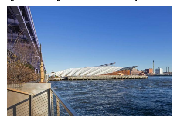
Figure 1 New York's Pier 35 ecological park and urban beach.

historical and cultural heritage while incorporating modern design.[1] For example, the renovation of London's King's Cross station square ("Figure 2"), freed up 7,000 m² of space, showcasing the railway station's Victorian façade while reflecting significant changes in the area in recent years.