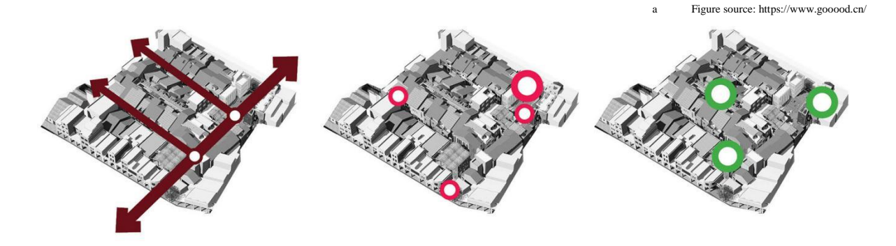
Figure 4 Three systems for the renovation of Yongqingfang old block.

However, there is still a need for in-depth exploration of specific practical cases and theoretical research on the renovation design of public spaces in the old urban areas surrounding the Yellow Crane Tower. This paper aims to draw on the current research status in China and use the surrounding area of the Yellow Crane Tower as a case study to extract a feasible design scheme from practical operations, in order to provide useful inspiration for the renovation of public spaces in old urban areas.