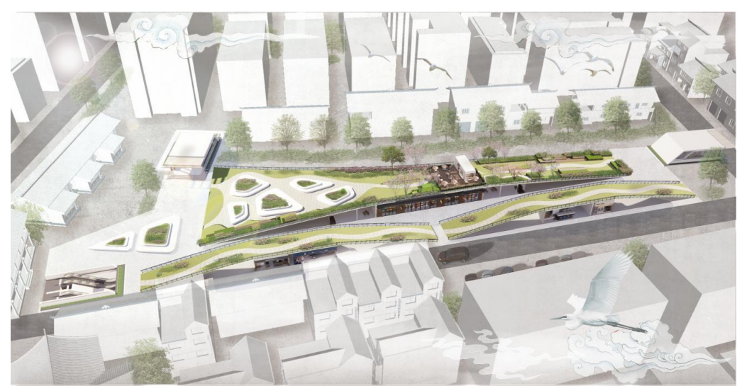
Figure 12 Aerial view.