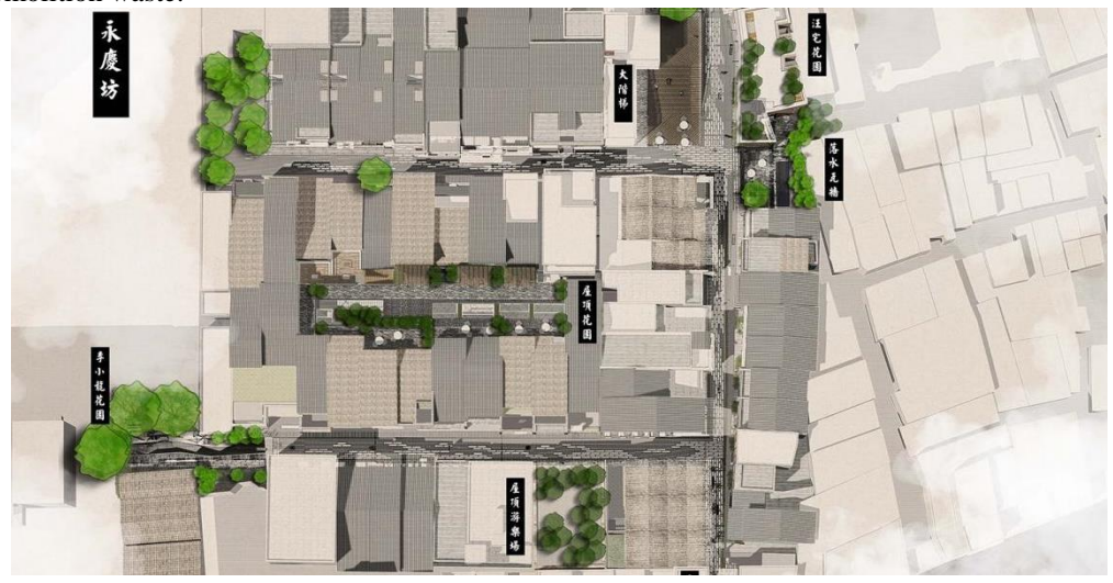
Figure 3 Renovation of Yongqing Fang old street block.

natural node systems ("Figure 4") to efficiently utilize demolition waste.