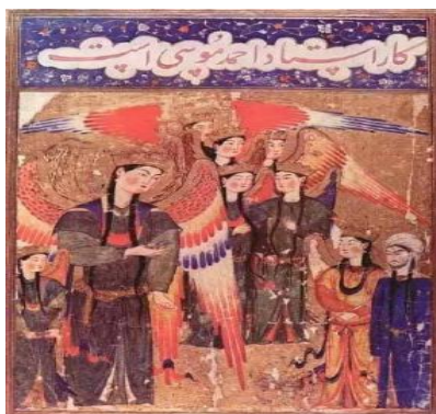
Figure 2 "Tabriz School of Paintings".