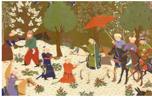
Figure 7 Illustration of The Book of Kings by Ferdowsi.