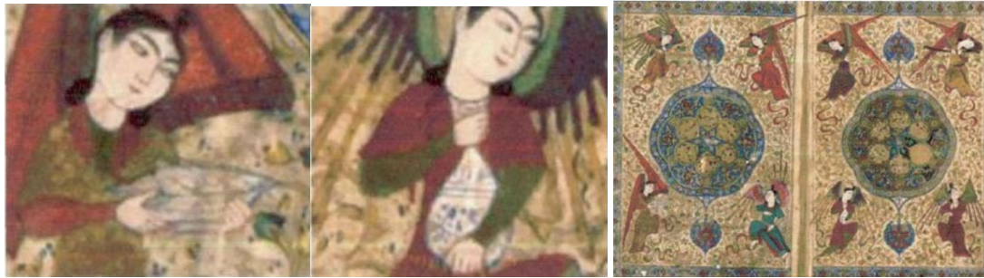
Figure 6 Two women holding a blue-and-white long-necked vase and a large blue-and-white bowl in The Book of Five Scrolls.