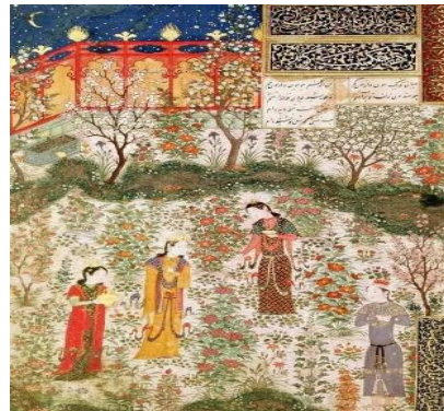
Figure 3 "Herat School of Painting".

In terms of painting styles, there are two more prominent periods, one is the "Magnificent School", i.e., the "Tabriz School" during the Ilkhanid Dynasty, and the other is the "Elegant School", i.e., the "Herat School" during the Timurid Dynasty. The other is the "Herat School" of the Timurid Dynasty.