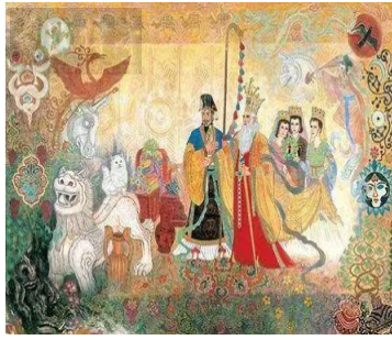
Figure 5 Zhang Qian's Mission to the Western Regions.