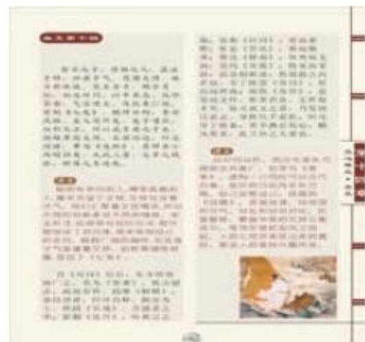
Figure 1 Layout case (Image from the Internet).

The overall font design should be simple and elegant, in line with the readability principles mentioned earlier. The layout design improves recognition, the overall design is light and concise, and reduces reading barriers, as shown in "Figure 1". In the design of academic books, it is necessary to ensure academic rigor while arranging a large amount of text in a relaxed visual effect. The font size of adult books is generally between size 10 and 12, with a minimum size of no less than size 6; The font size of books for the elderly should be specified between the size 14 and size 16, and cannot be less than the size 10. People can choose a gentle, rounded, smooth, and simple font form for font selection. The design of the layout is extremely important, and the reading efficiency, reading time, and reading speed of elderly students have their own unique reading rhythm. Elderly people have slower eye movements and are not suitable for excessive layout design. They need to be accompanied by pictures and text to provide sufficient reading space for elderly students, reducing the fatigue experienced by elderly people when reading.