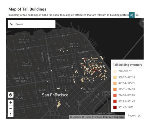
Figure 2 Distribution of high-rise buildings height by 240 feet and above.

damage from disasters such as earthquakes, floods, hurricanes, and tsunamis, including levels of analysis on Basic or Advanced to generate more accurate and applicable estimations on urban loss.