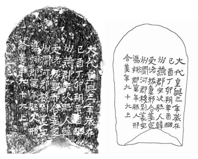
Figure 2 Rubbings of Xing Hejiang tombstone (left) and line drawing of Xing Hejiang tombstone (right) of Northern Wei Dynasty.