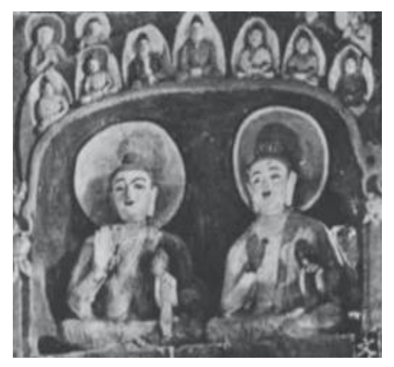
Figure 6 The image of Seven Past Buddhas in the niche of the upper eastern wall of Cave 11 of the Yungang Grottoes in the seventh year of Taihe period of (483) Northern Wei Dynasty.

followed the second type mentioned above, i.e., a symmetrical structure with Vipasyin Buddha as the center, moving in turn to the sides. However, the dignity of the remaining six Buddhas remained to be verified.