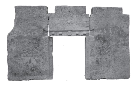
Figure 8 Seven Past Buddhas on the south side (outside) of the south wall of the Funeral Stone House of Xing Hejiang's Tomb.

Considering the special role of the Seven Past Buddhas for the deceased in Pingcheng period and the funerary context in which the images of the stone house were located, each Buddha should be associated with the deceased, not just as a replica of the Buddha House in front of the deceased's body in the matter of death, but more as a transcendental function.