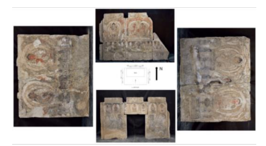
Figure 4 Colored spatial location of Funeral Stone House of Xing Hejiang's Tomb, Northern Wei Dynasty.

Figure 3 Painted layout chart of Funeral Stone House of Xing Hejiang's Tomb, line drawing, Northern Wei Dynasty.