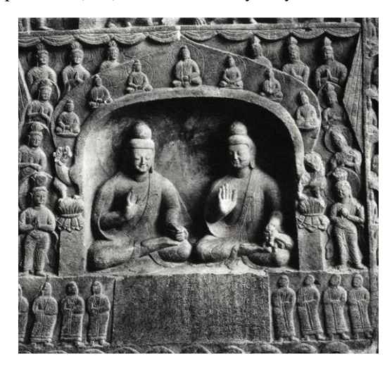
Figure 7 Seven Past Buddhas in the statue niche on the lower east side of the Ming Cave in Cave 17 in the 13th year of Taihe period (489) of Northern Wei Dynasty.

Figure 6 The image of Seven Past Buddhas in the niche of the upper eastern wall of Cave 11 of the Yungang Grottoes in the seventh year of Taihe period of (483) Northern Wei Dynasty.