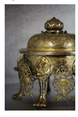
Figure 2 The silver incense burner with a gilt recumbent turtle and lotus flower patterns.

In the Song Dynasty, the shape of the multifooted burner abandoned the complexity of the Tang Dynasty and simplified the complex shape. The Longquan kiln plum green three-legged burner of the Southern Song Dynasty (see "Figure 3") is gentle and elegant in color, unlike the flamboyance of the previous dynasty. The mouth is slightly folded out, the neck is shallow and the belly is bulging, and the whole piece is simply decorated with a raised bow string pattern connecting the neck and belly to the bottom of the three-legged foot, a style that is quite different from that of the previous dynasty.