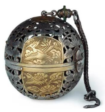
Figure 5 A silver incense ball with bird and flower patterns.

The Tang Dynasty was a powerful state, so there were a number of extremely ornate and beautifully decorated incense burners made of gold and silver. The main materials of incense burners discovered during the Tang Dynasty are silver and silver-plated gold, with silver and silver-plated gold incense burners being the most common 4. In addition to the raw materials, more gilt, inlaid gold and silver are used as the raw material for the decorative patterns embellished on various parts of the incense burner. A gilt-gold silver incense ball with bird and flower patterns (as shown in "Figure 5") may be used as an example. The ball is 5.1 cm in height and about 4.8 cm in diameter, being exquisitely elegant, with a silver body and gilt outer laver.