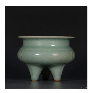
Figure 3 The Longquan kiln plum green threelegged burner of the Southern Song Dynasty.