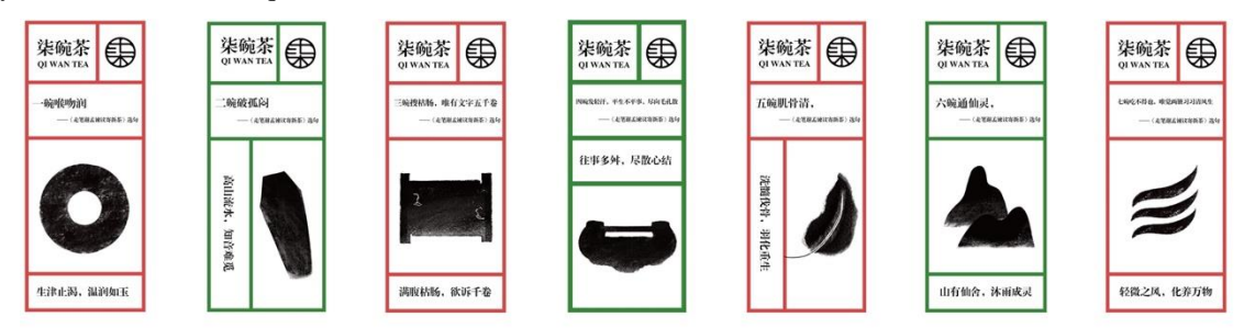
Figure 4 "Qi Wan" tea packaging copywriting application.

In the packaging design of the "Qi Wan" tea gift box, each built-in independent packaging has a different verse selected, so that people can read and taste the poem while tasting tea, adding a different small interest when drinking tea and enhancing the interactivity of tea packaging. At the same time, each verse is accompanied by a corresponding interpretation, which can not only enhance people's understanding of the tea poem, but also become a topic of interaction when drinking tea with friends ("Figure 4").