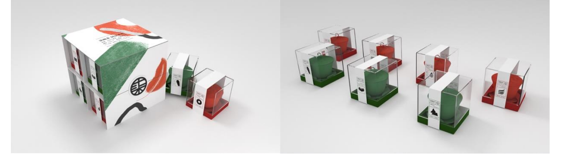
Figure 1 "Qi Wan" brand tea packaging design. (Source: drawn by the author)